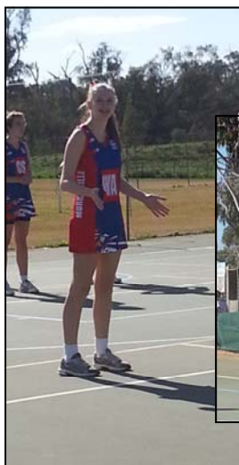
More photos from our netball section of the recent Winter Games at Robinvale