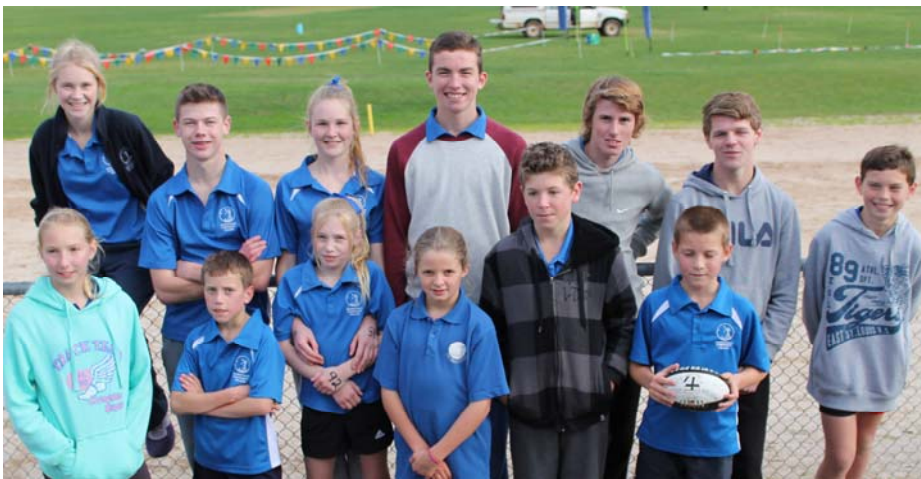
The group of students who competed in regional Cross Country finals in St Arnaud