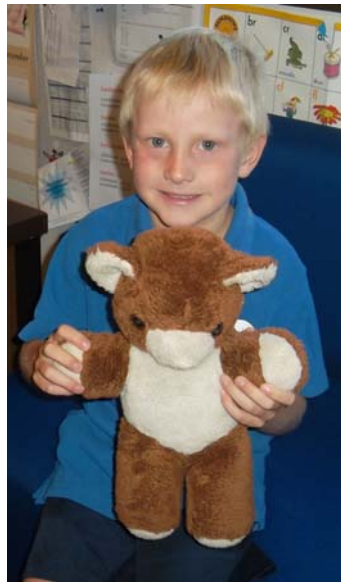
My teddy is called Brown Bear. He plays a lot with me.