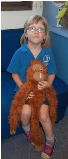
My teddy is called Fluffy. I like him because he can climb on sticks.