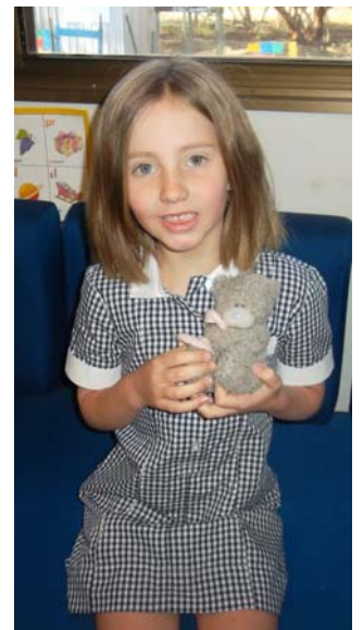
My teddy is called Lilly. I like it because it has words on its foot.