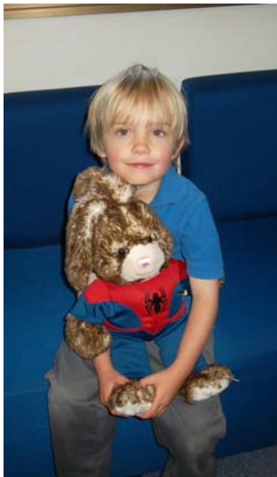
My teddy is called Spiderman Rabbit. I like him because I sleep with him.