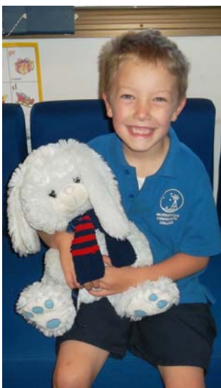
My teddy is called Rabbit ...