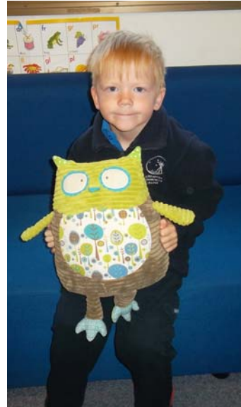
My toy is called Owl. I like him because he plays with me.