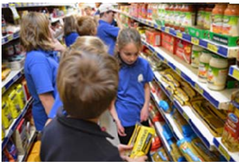
Scanning the aisles for options

This term, the 3/4 class took on an adapted $2.00 a day Poverty Challenge as part of their Money Matters studies. Having learnt about many of the challenges and hardships faced by people living in poverty the students were eager to attempt to feed themselves for one school day on just $1.00 each. Students identified the differences between needs and wants when it comes to food, and then conducted research into cheap, filling options. Shopping for our supplies was a rewarding experience as the students weighed up the cost, quantity and nutritional benefits of items. In the end, they were very proud of their efforts, and actually managed to provide the class with more than enough food at a cost of just 72 cents each. At the end of the day students shared their thoughts about the challenge and it was heartening to hear their empathy for those who are less fortunate than them; their desire to assist those living in poverty; and their acknowledgement that we had been lucky to still have more than enough for our needs on the day a privilege that those living in extreme poverty lack.