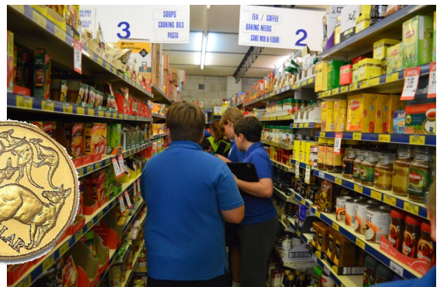
Students shopping with their $1 for the poverty challenge