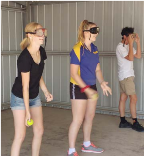
A group of our Years 10 and 11 students spent 3 days last week undertaking the Charlton Driver Education course. They had quite a few coordination problems when they had to wear 'beer' goggles, and then realised how severely alcohol impairs judgement.