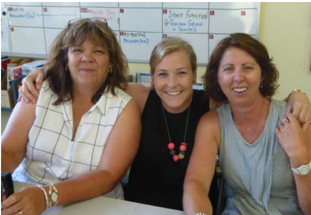
From the Principal

Inspiring P.R.I.D.E. • We Value • Persistence Respect Independence Determination Excellence