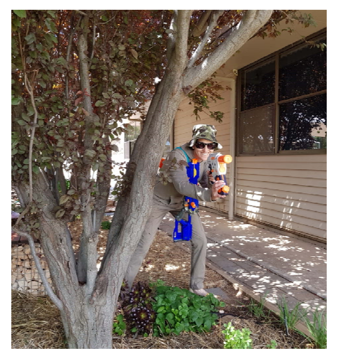
Mrs Parker on yard duty last Fríday revenge on Year 12 duríng muck-up day

next week Pies / Pasties $4.50 Large Sausage Rolls $3 Party Pies $1 Sauce 20c Pizzas (Ham & Pineapple or Bacon & Cheese) $2 Please - no more than $5 in your envelope <u>NO sandwiches or wraps</u>