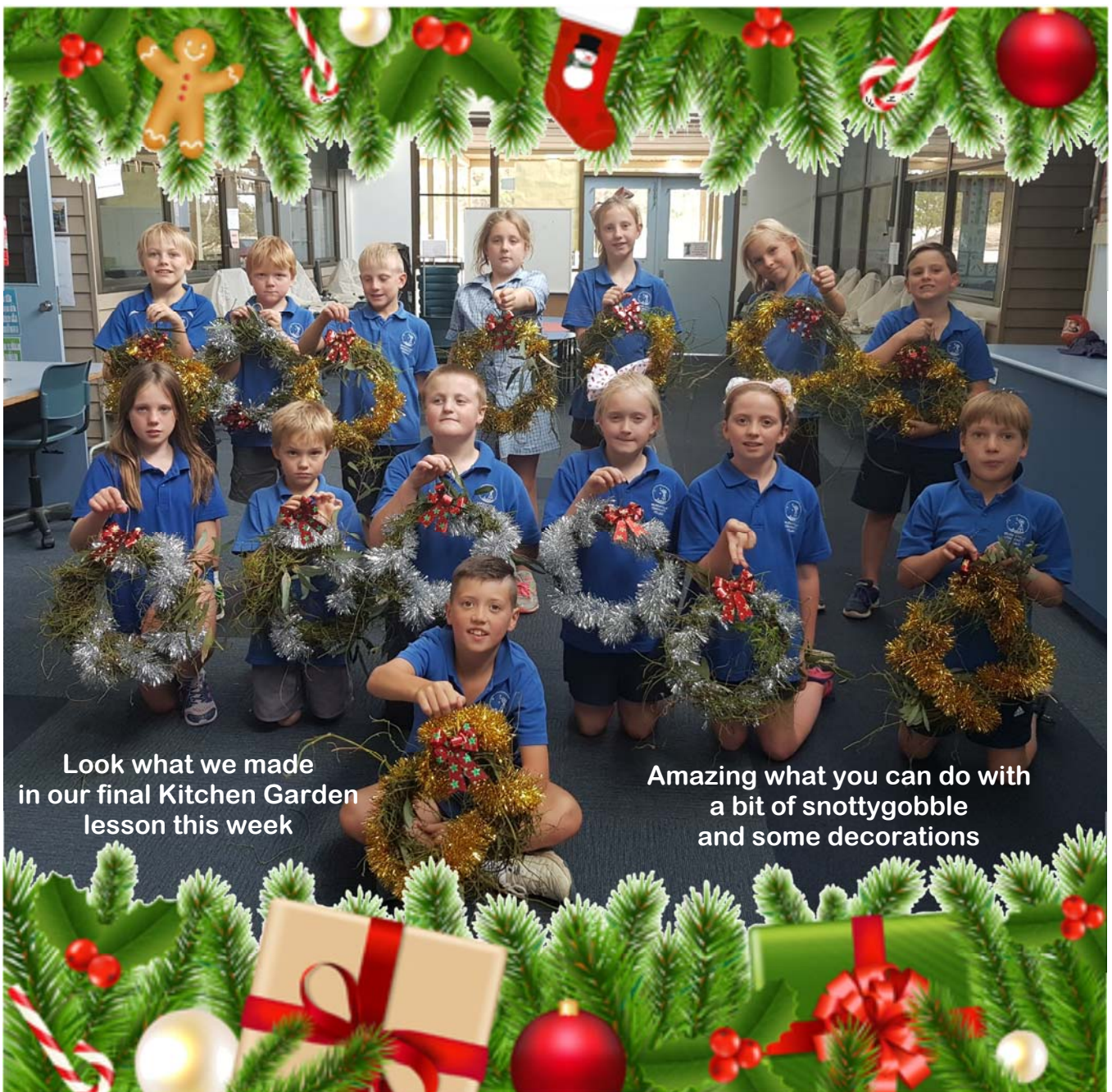
Look what we made in our final Kitchen Garden lesson this week