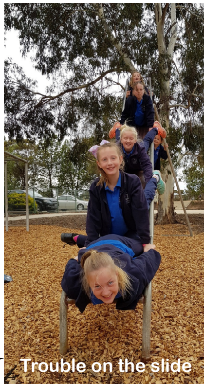
Trouble on the slide