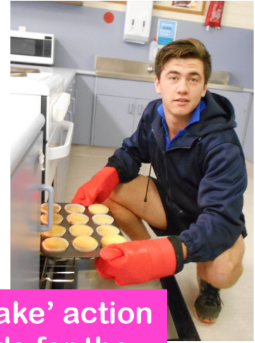
SRC in 'cupcake' action to raise funds for the McGrath Foundation