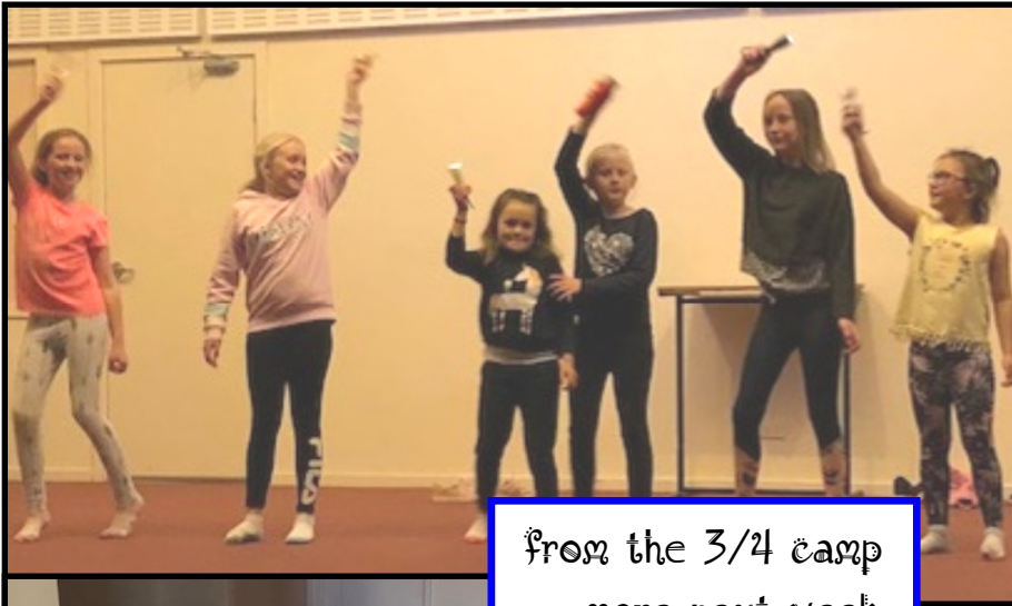
from the 3/4 camp ... more next week