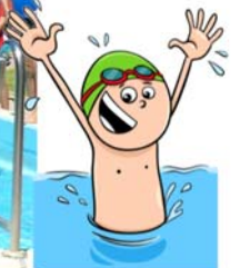
Champions and Runners-Up across the secondary age groups