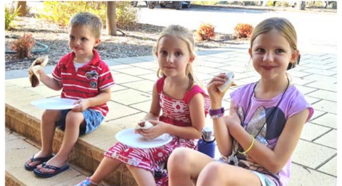
Snapshots from the evening of the College Council BBQ