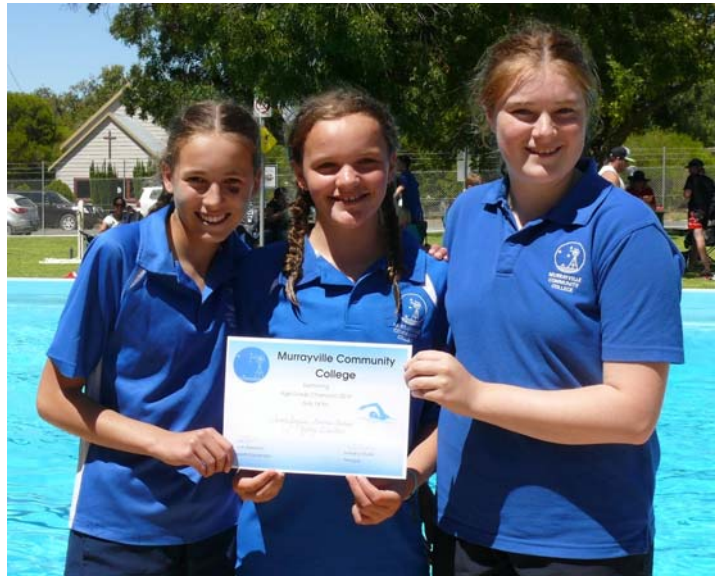
A three-way tie in the 14 years Girls Championship!