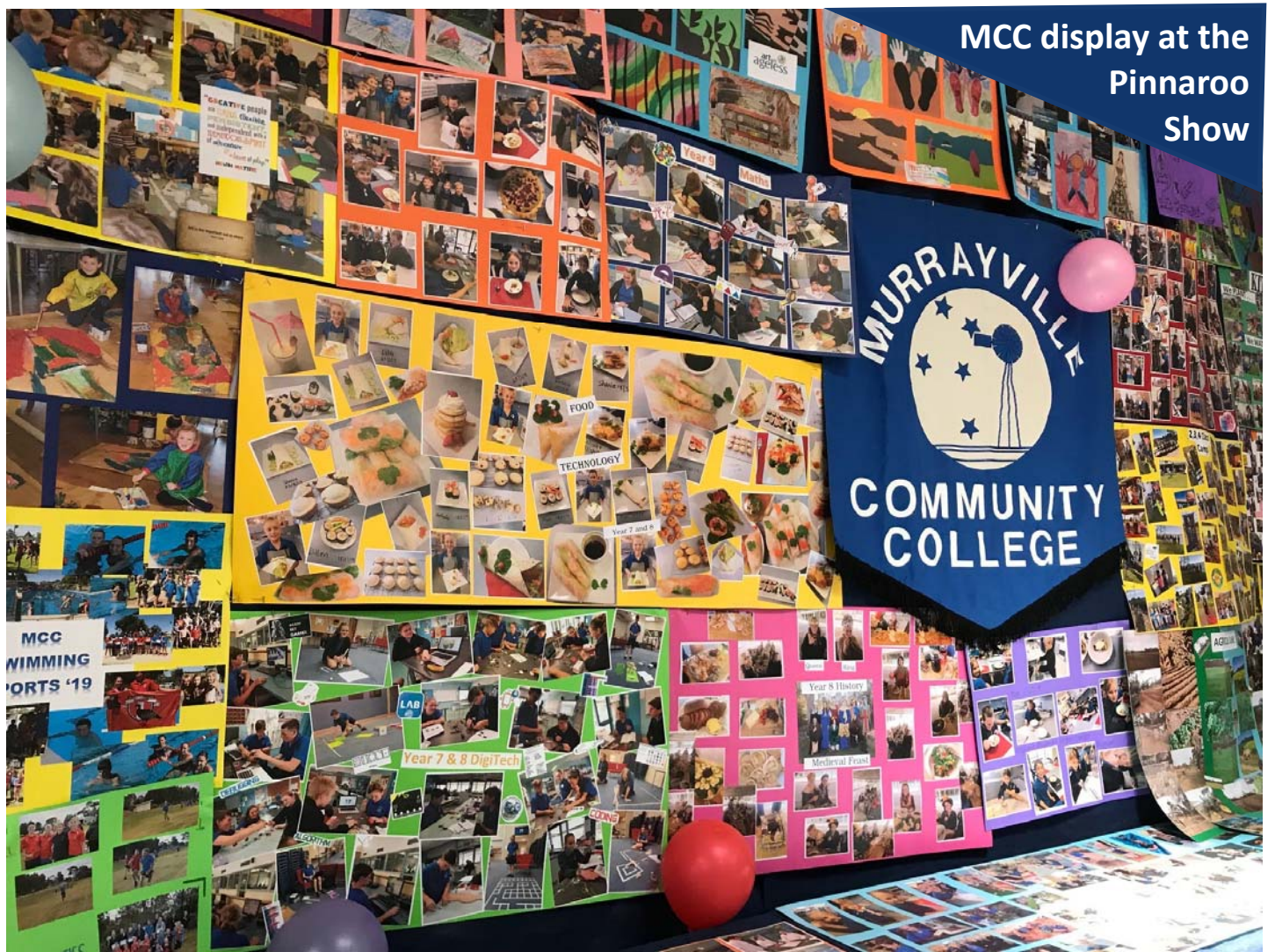
MCC display at the Pinnaroo Show