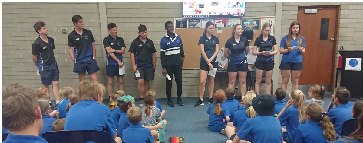
The Year 12 group addressed students and shared special memories of their school days at their final assembly on Thursday, as well as thanking staff for their support over the years.