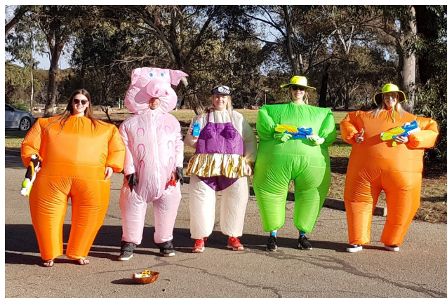
We were greeted with this odd group on Friday morning - part of the Year 12 Muck Up Day pranks! Their final exams commence on Wednesday of this week.