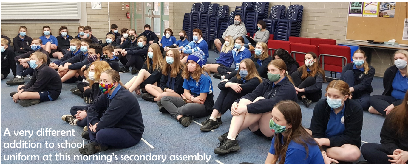
A very different addition to school uniform at this morning's secondary assembly

The Principal will email parents with the latest COVID-19 restrictions and how they will alter schooling when further details are provided, probably tomorrow.