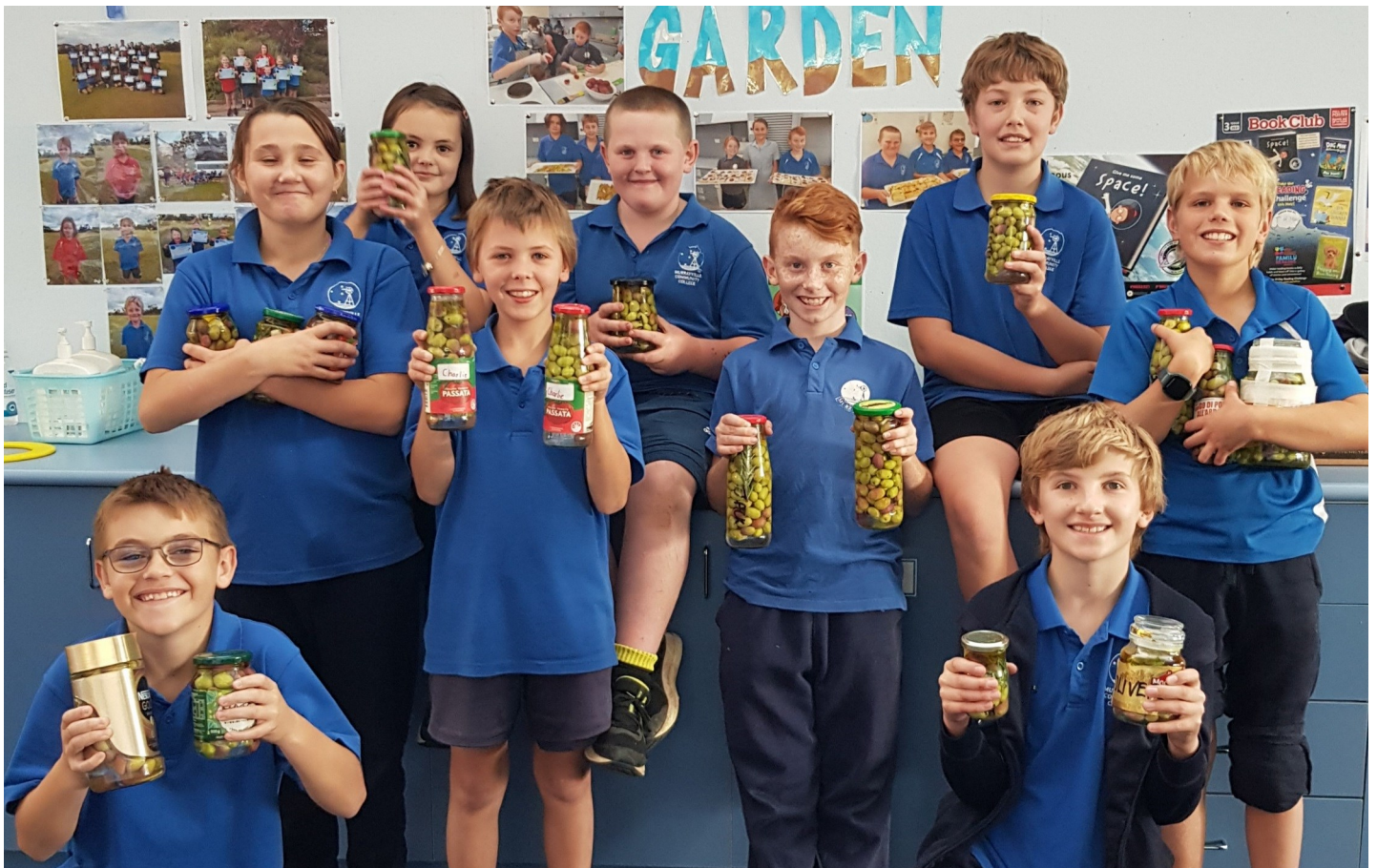
Here are the 5/6 students with the olives that they plucked from the school's tree and processed in brine. In 4 weeks' time they will be able to taste them!