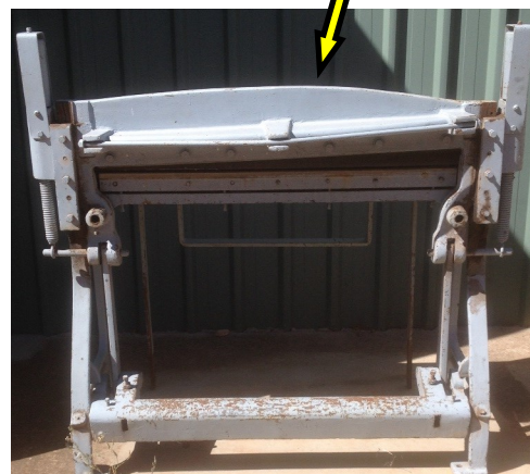
Sheet Metal Guillotine – 900mm wide cut