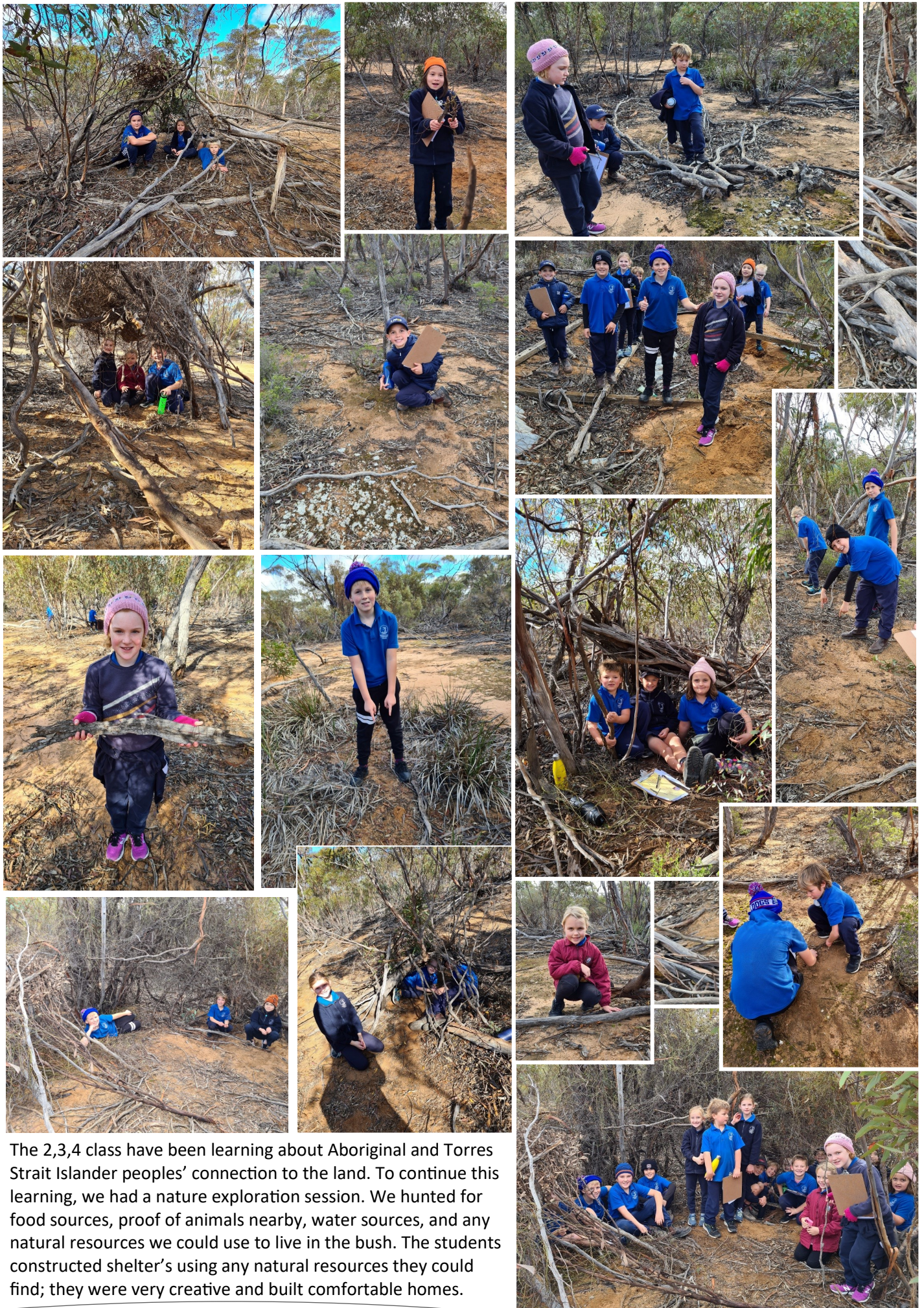
The 2,3,4 class have been learning about Aboriginal and Torres Strait Islander peoples' connection to the land. To continue this learning, we had a nature exploration session. We hunted for food sources, proof of animals nearby, water sources, and any natural resources we could use to live in the bush. The students constructed shelter's using any natural resources they could find; they were very creative and built comfortable homes.