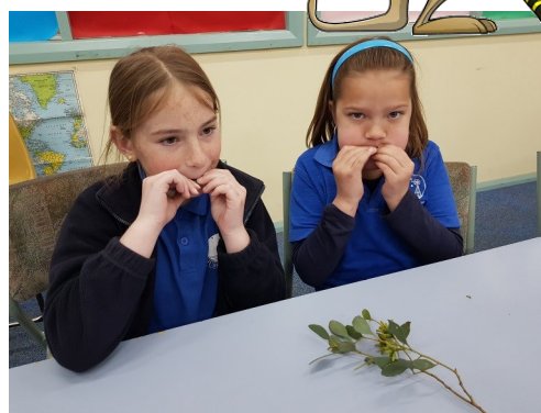
Year 2-4 students found they could use their mouths to make a wide variety of sounds in their music lesson on Friday. They started with Australia in their studies of music around the world.