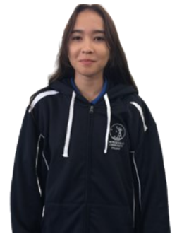
Sport Jacket (hoodie)