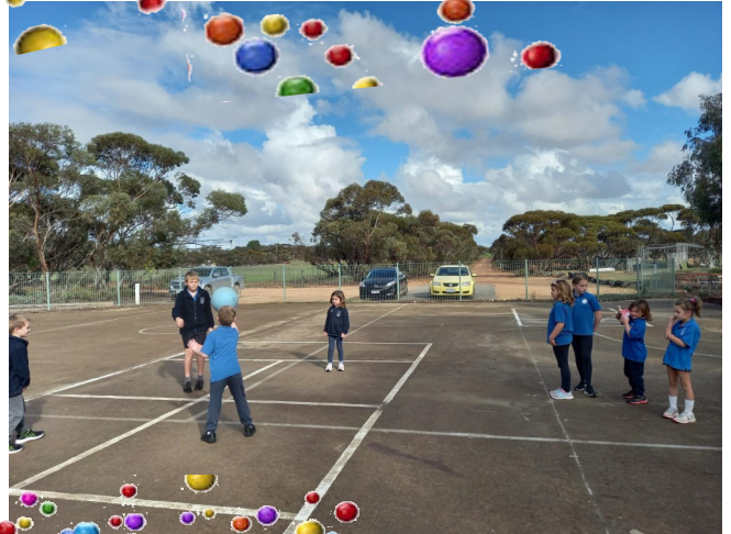
Lots of fun to be had at the handball club last week.