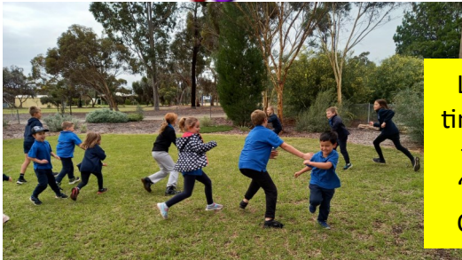
Last lunch time club for the term. 'Crocodile Crocodile'