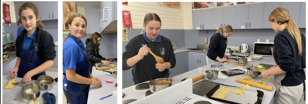
Apple Turnovers were on the menu in Food Tech last week - they tasted as good as they smelt, and were very welcome on such a cold day.