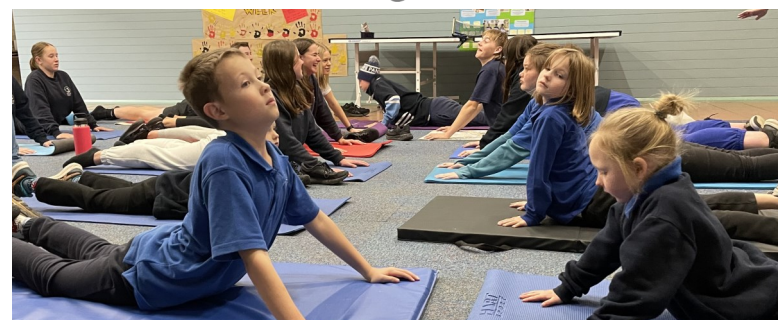
Many students (and some staff) took up the opportunity to participate in a Yoga session during lunch yesterday

A smile is a curve that sets everything straight